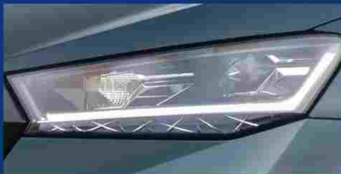
»» LED Headlamps with DRLs