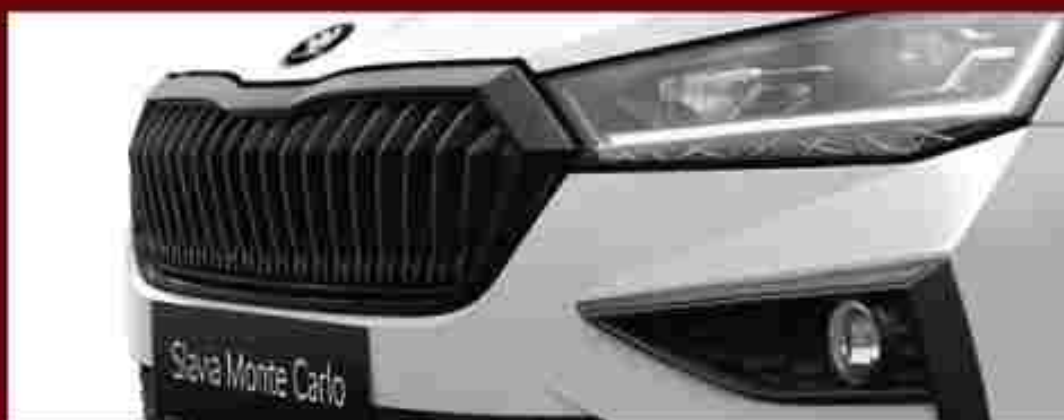
»» Black Škoda Signature Grill