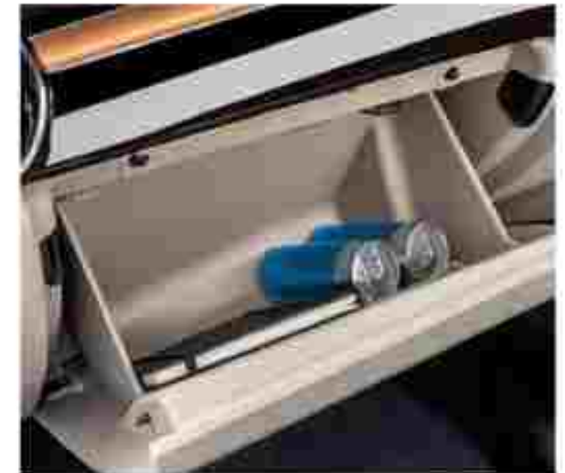
Cooled Glove Box