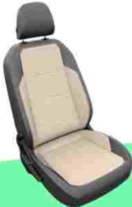
Ventilated Black Leatherette Front Seats With Perforated Beige Design