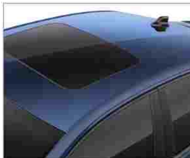
»» Electric Sunroof