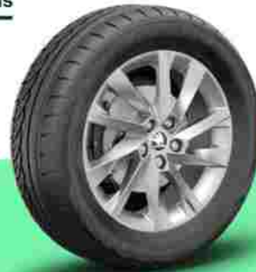
R16 Lynx Alloy Wheels