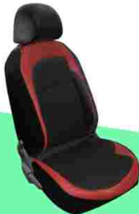
Monte Carlo Inscribed Ventilated Front Leatherette Seats