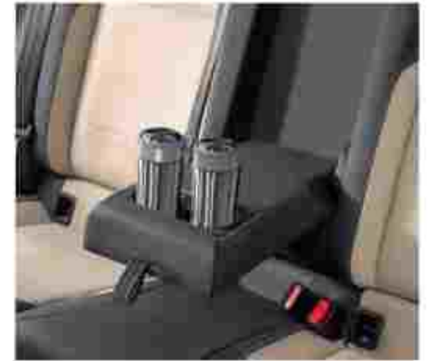
Cupholders In The Armrest