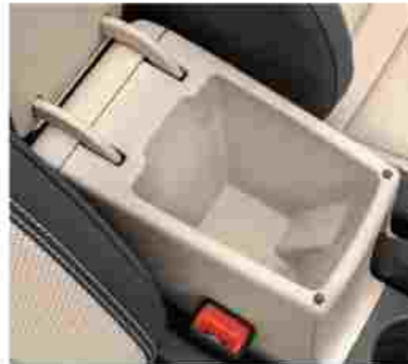
Storage In Front Centre Armrest