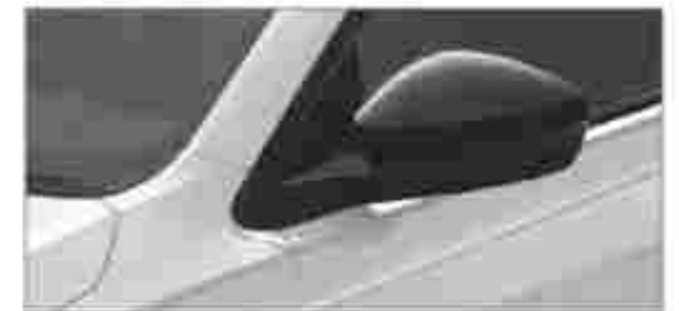
» Glossy Black ORVMs