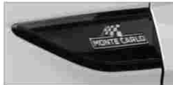
» Exclusive Monte Carlo Badging