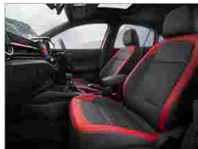
»» Monte Carlo Inscribed Ventilated Front Leatherette Seats