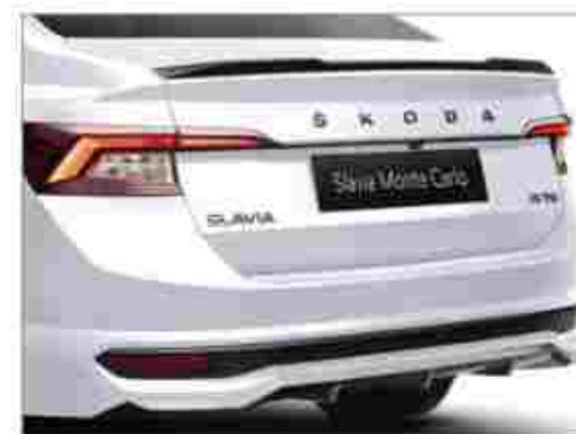
»» Sporty Black Exterior Package