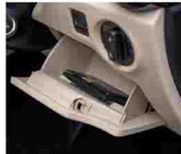
Driver Storage Compartment