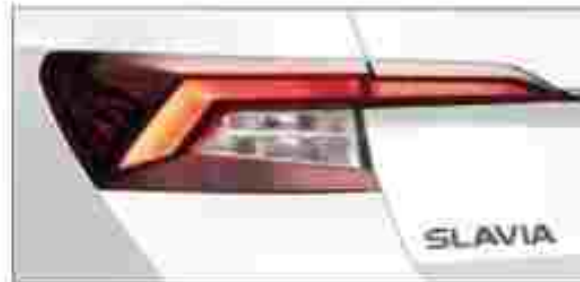
» Darkened Tail Lamps