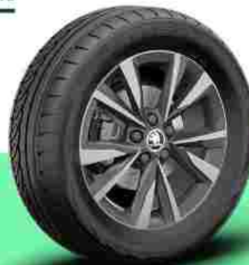
R16 Ving Alloy Wheels