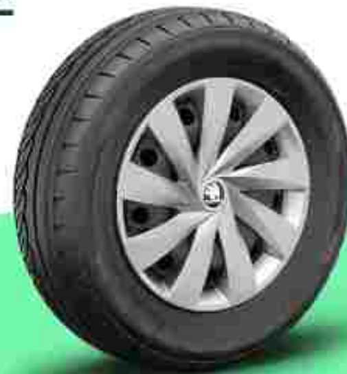
R15 Steel Wheels With Carme Wheel Cover