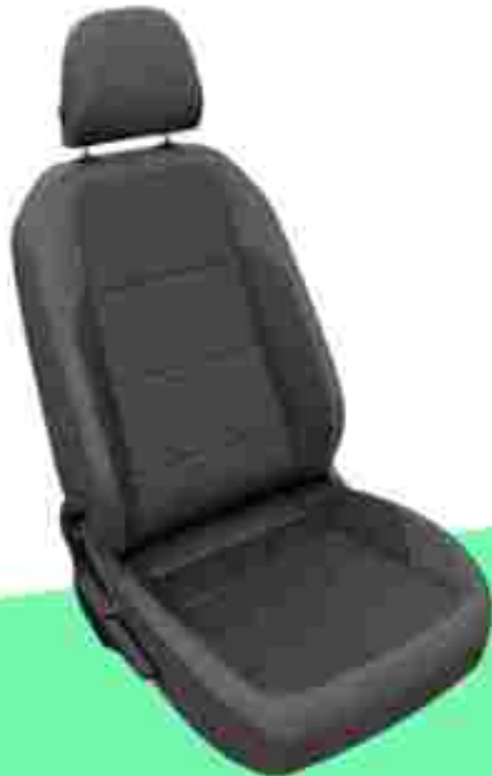
Black Fabric Melange Woven Seats