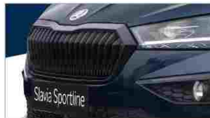
» Black Škoda Signature Grill