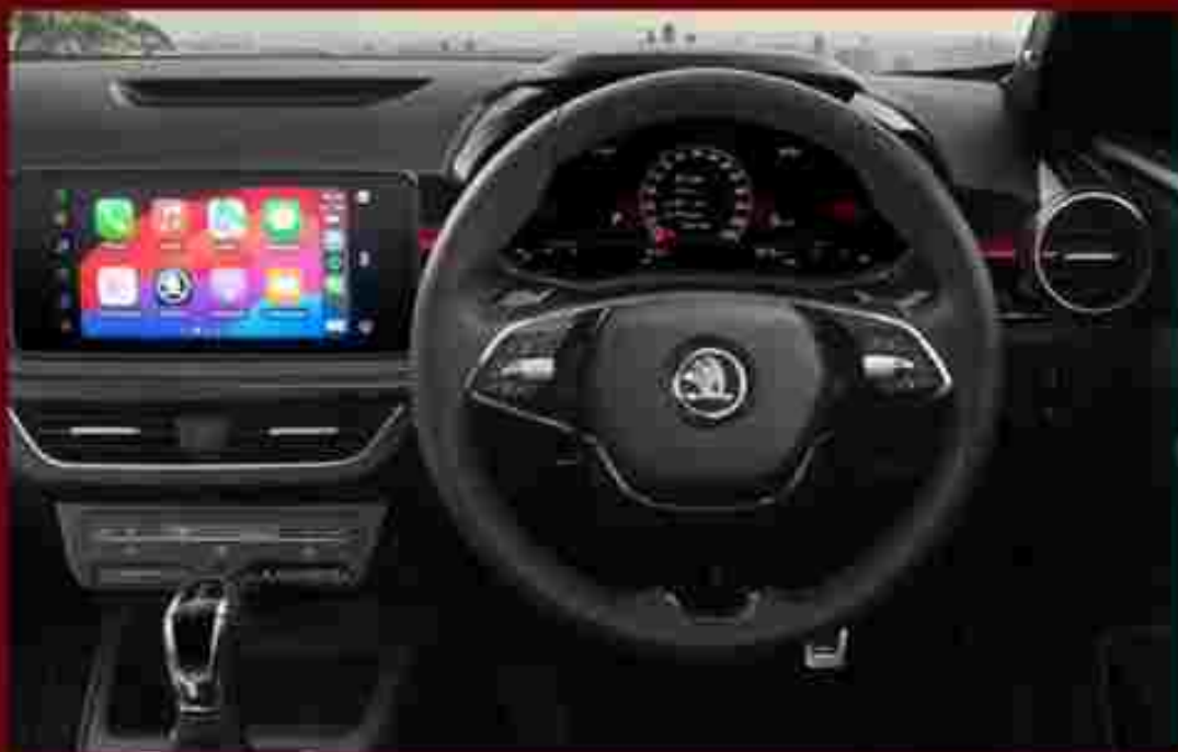
»» 20.32cm Škoda Virtual Cockpit with Red Theme