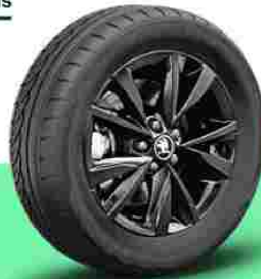
R16 Black Ving Alloy Wheels