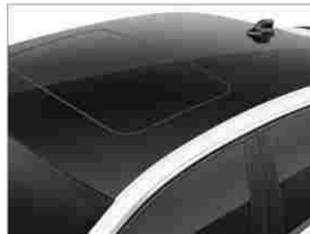
»» Dual Tone Electric Sunroof