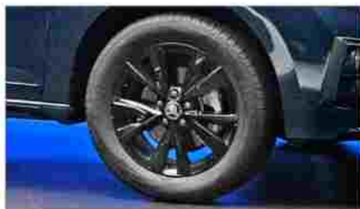
» R16 Black Alloy Wheels