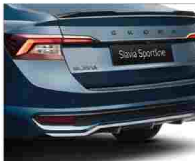
»» Sporty Black Exterior Package