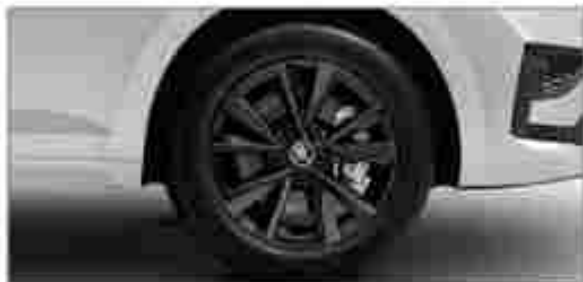
» R16 Black Alloy Wheels