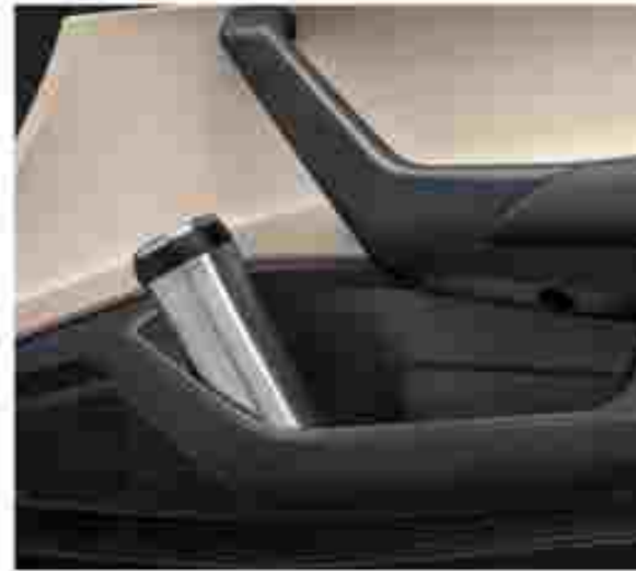
Storage In Front And Rear Doors

Never compromise on boot space. Skoda Scala sets the standard with best-in-segment storage – 527 litres with rear seats up, and a whopping 1050 litres when folded down.