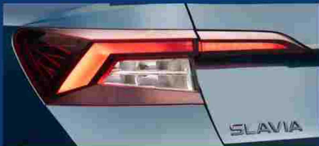
»» Darkened Tail Lamps